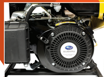
SUBARU EX ENGINE

PROUD TO BE 100% NEW ZEALAND OWNED & OPERATED