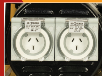
IP66 RATED PLUG SOCKETS